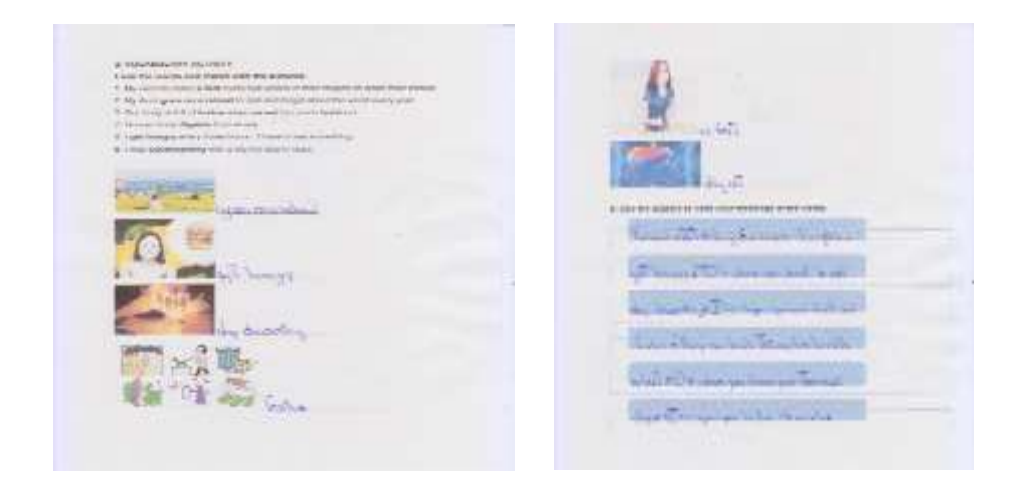
Fig. 3 STUDENT B

During the reading of the text, both students complete a chart with the main idea and some details. Student A began to read the whole text, then read task 3 to do the exercise. A did not give a clear explanation for the main idea and details. Fig. 4 shows the answers.