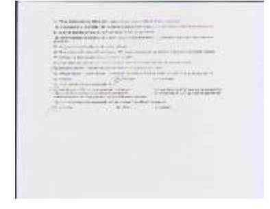
Fig.1: STUDENT A