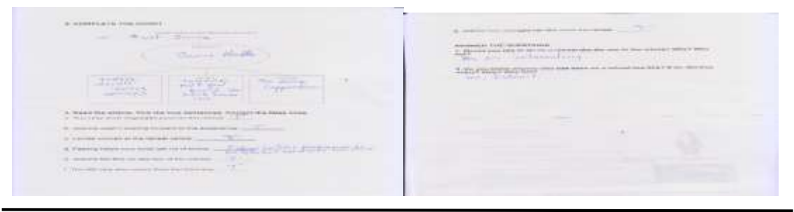
Fig. 4 Student A

In the second part of the activity, Students had to write answers to two questions with opinions related to the topic. Student A answered partially, by contrary student B 's answers were much clearer. Fig. 4 shows the answers.