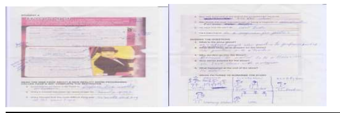
Fig.9 Student A's Reading activities

Student B underlined sentences that could answer the questions at the end of the text. This student wrote clearer meanings for the words guessed from context and the notes in the chart describe better details from the text. Student B did not need the dictionary to have the meaning, although it was not an exact meaning, it was very close and helped in the reading comprehension. Task was completed successfully, and in task two the answers were clearly stated, only one answer was incorrect. The pictures made to summarize the text represented quite well the story in different moments and were exposed clearly at the moment of telling the story.